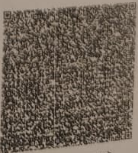
QR Code with Photograph