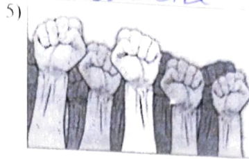
Right to information