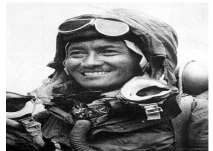
SHERPA TENZING NORGAY