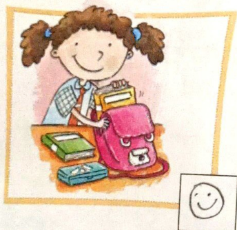
Pack school bag