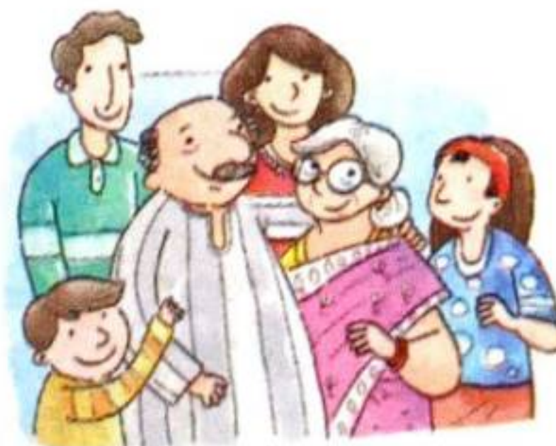
A small joint family