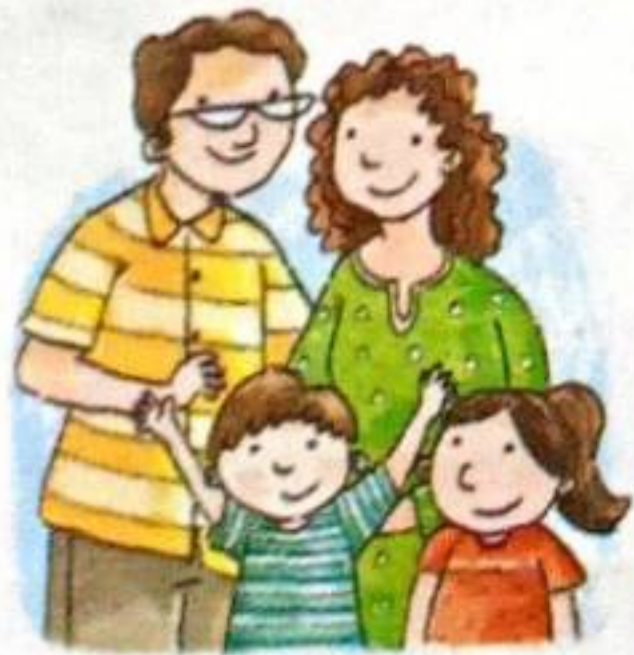
A small nuclear family