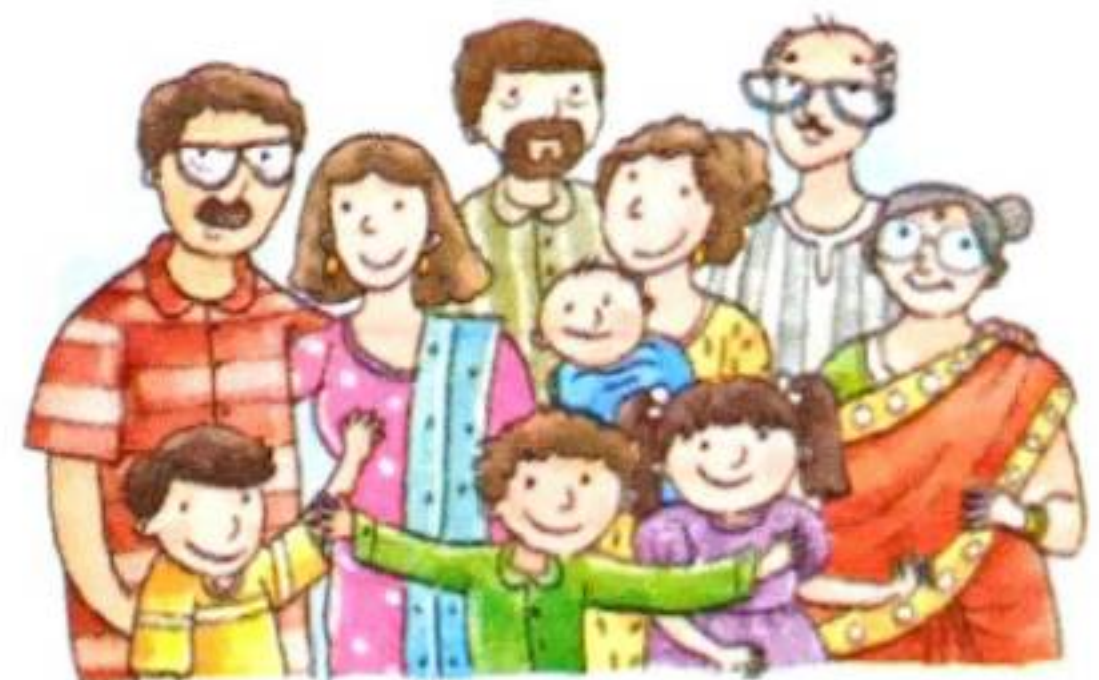
A big joint family