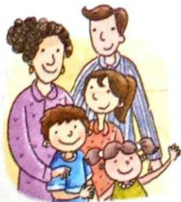
A big nuclear family