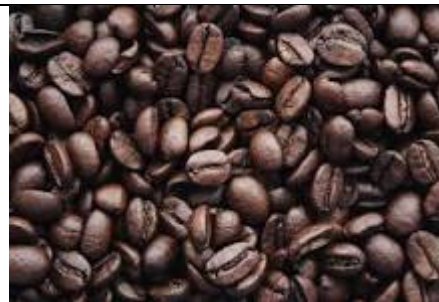
v. COFFEE BEAN