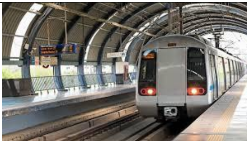
iv. METRO TRAIN