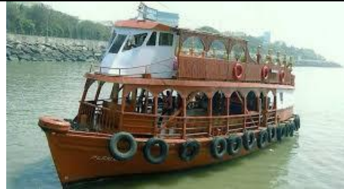
iii. FERRY BOAT