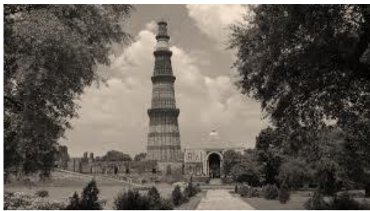
iii. QUTUB MINAR