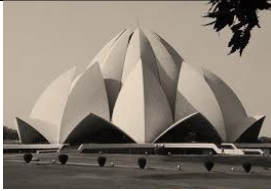
ii. LOTUS TEMPLE