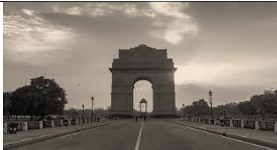
iv INDIAN GATE