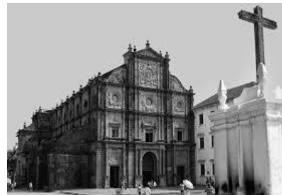
Basilica of Bom Jesus