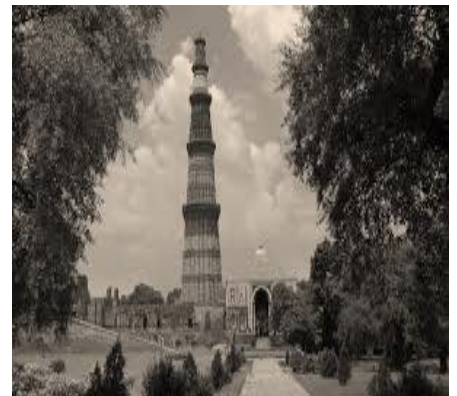
3) Qutub Minar