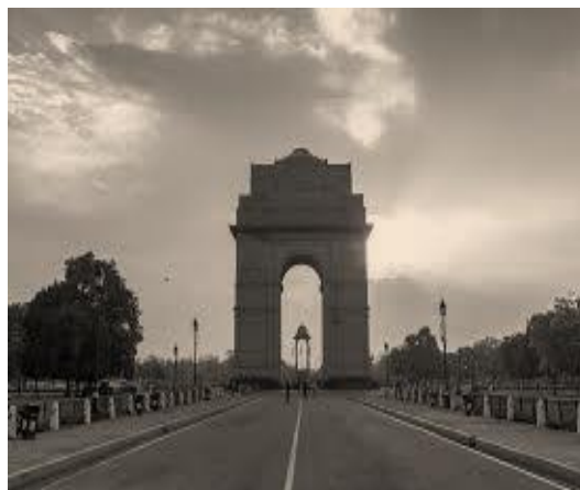
5) India Gate

IMP NOTE: Kindly refer the textbook also for the exam.